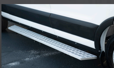
ERGONOMIC RUNNING BOARDS