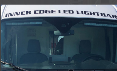
INNER EDGE FRONT LIGHTBAR