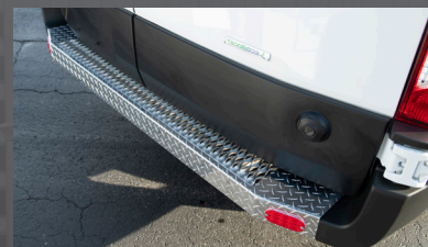
DIAMOND PLATE BUMPER OPTION