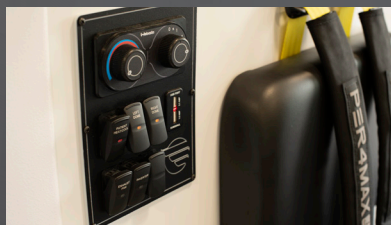
CURBSIDE SWITCH CONTROLS