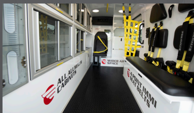
ALUMINUM CABINET CONSTRUCTION