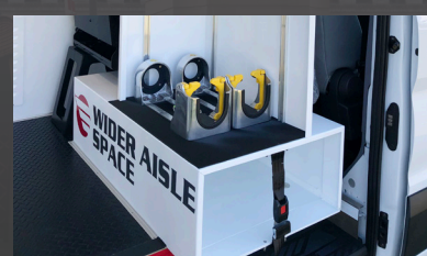
STAIRCHAIR STORAGE HORIZONTAL ON BULKHEAD