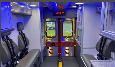
HINGED WIRE TROUGH WITH LED LIGHT OPTION