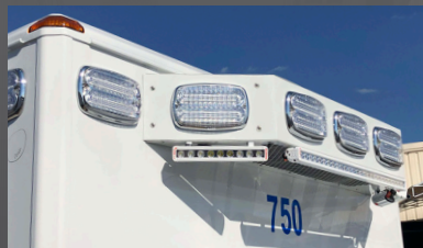
COOL-BAR AND CORNER CAP LIGHTS