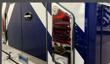
WHEELED COACH LED STOP TAIL AND TURN LIGHTS W/ BEZEL