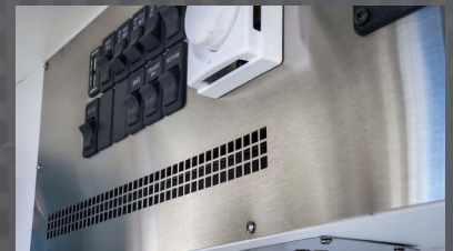
TURBO AIR SYSTEM IN THE ACTION AREA