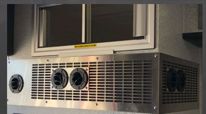
ADDITIONAL EVAPORATOR IN MODULE